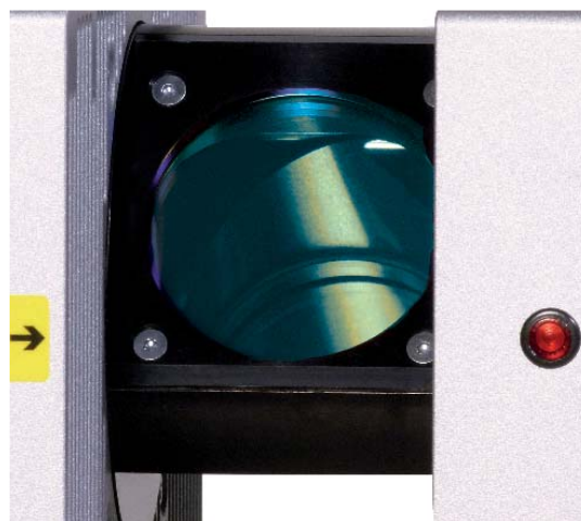
Rotating mirror for 310° vertical scanning