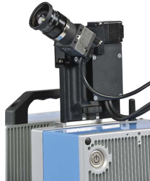
The M-Cam can be mounted effortlessly

Detailed descriptions about numerous additional accessories are available at www.zf-laser.com .