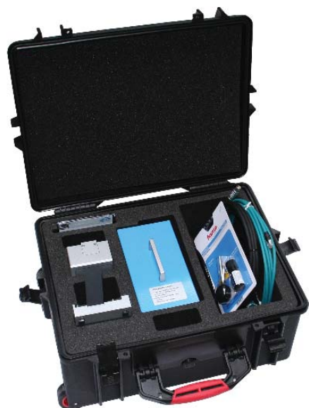
The hard case ensures the safe storage of the accessories

Every Z+F laser scanner is delivered with an accessory case that includes the following items: