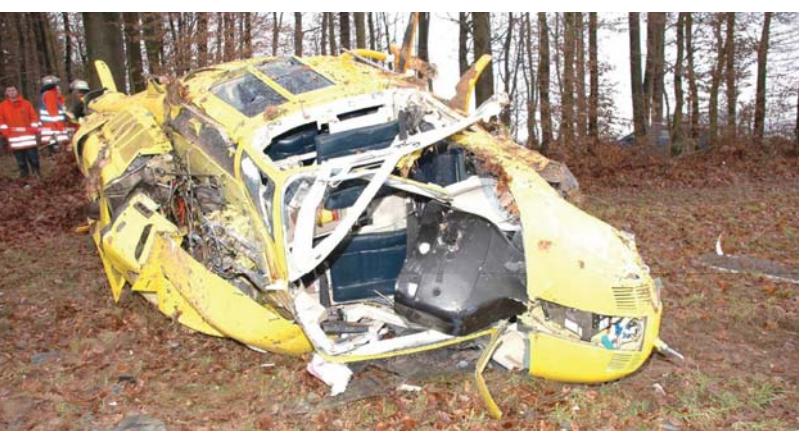
Helicopter crash Regional CID Baden-Württemberg

LaserControl software, the scenes can be visualized afterwards. This leads to great time savings for accident reconstruction, checking plausibility where manipulation is suspected and many other insurance purposes.