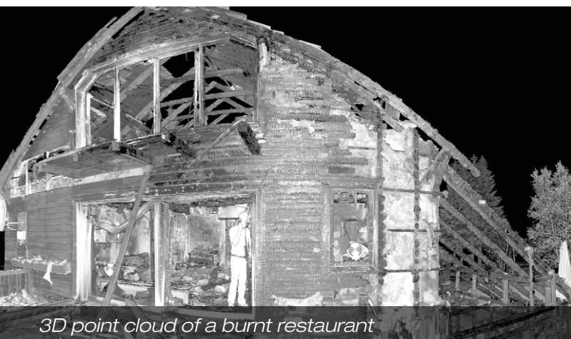
3D point cloud of a burnt restaurant

cloud to be coloured, which gives a photorealistic impression of a scan with a high level of detail. The low noise level means that despite long distances, a very high data quality and scan resolution can be achieved and even small details can be captured.