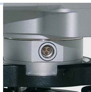
External power supply and Ethernet at the non-rotating scanner base