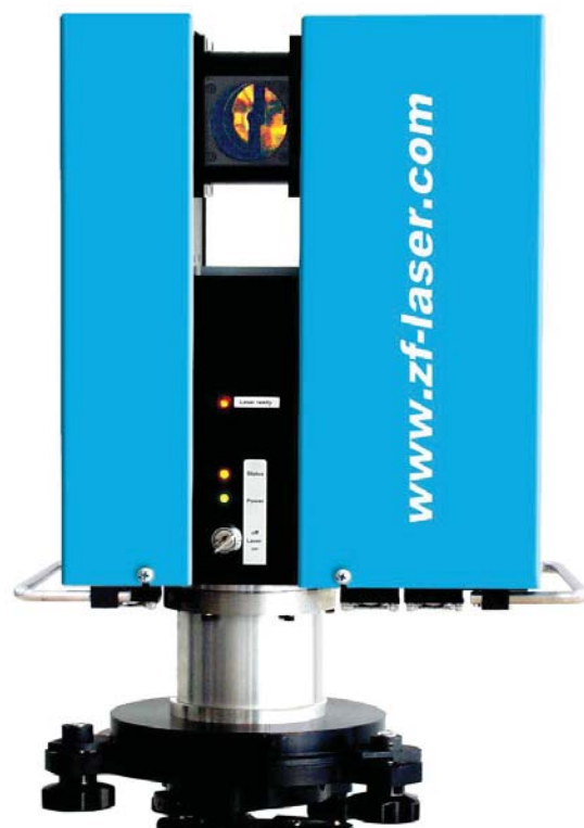
The first compact device: Z+F IMAGER 5003

In 2006, the success story of the IMAGER series was continued with the Z+F IMAGER 5006. Thanks to its integrated control panel, a powerful internal PC, hard disk and internal battery, the IMAGER 5006 was the first stand-alone 3D laser-scanner worldwide.