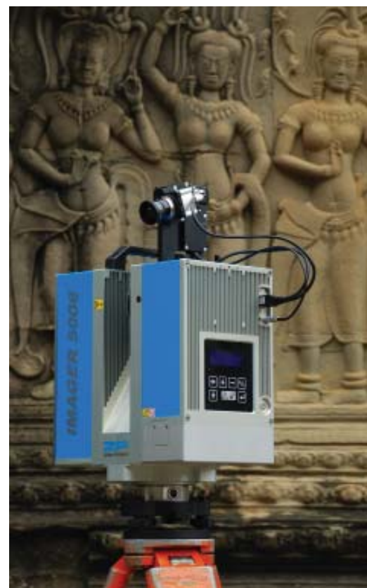
In operation in Angkor Wat: Z+F IMAGER 5006i

The relationship to costumers and partners is most important for Zoller + Fröhlich. Users worldwide appreciate our personal service and technical support. Today Zoller + Fröhlich is one of the leading enterprises in the field of contact-free laser measuring technology. Thanks to years of practise and countless concluded projects, we built a wealth of experience and success. At present, Zoller + Fröhlich is represented in 40 different countries with branches in England and USA, and many sales co-operations throughout the world. The success of Zoller + Fröhlich can be attributed to first-class service and personal advice.