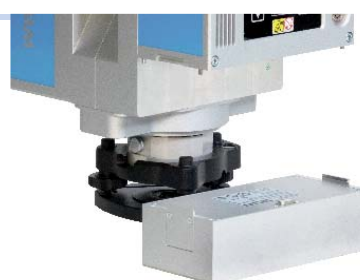
Changeable battery pack

- Data transfer to an external hard drive is possible via the USB connection.