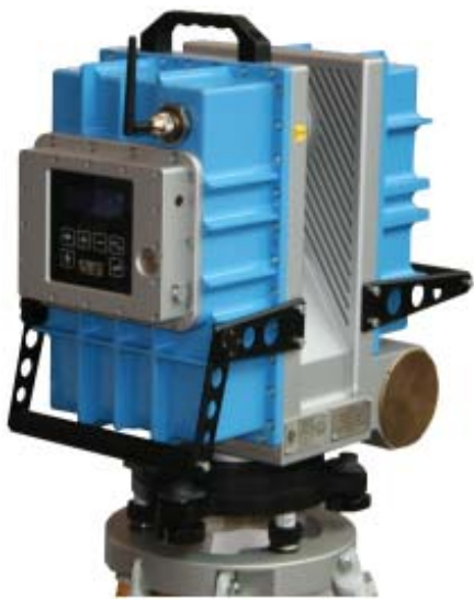
Explosion proof: IMAGER 5006EX